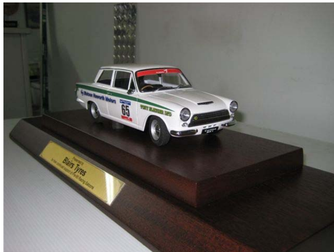
Photo of the Cortina model presented to Blairs Tyres (Kumho). I know it's a Ford. I do slip occasionally.

Not much else to report. Will see you all at checking day.